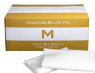
White Liner, Compostable 200pc/Carton