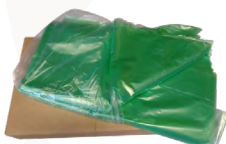
Green Liner 200pc/Carton