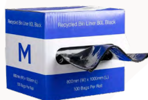
Black Liner 100pc/Dispenser Box