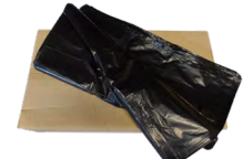
Black Liner 250pc/Carton