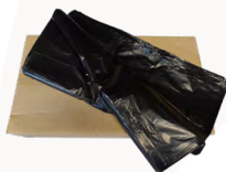
Black Liner 250pc/Carton