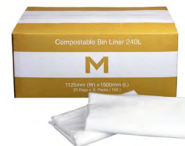
White Liner, Compostable 150pc/Carton