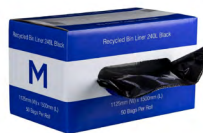
Black Liner 50pc/Dispenser Box