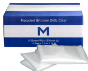
Clear Liner, Heavy Duty 50pc/Carton