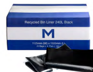
Black Liner, Heavy Duty 100pc/Carton