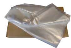
Clear Liner 200pc/Carton