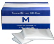
Clear Liner, Heavy Duty 100pc/Carton