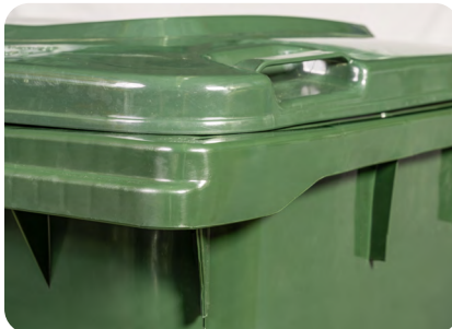
• Lid – Handle cover