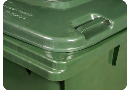
• Lid with two handles