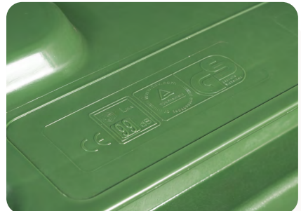
• Certification logo embossed