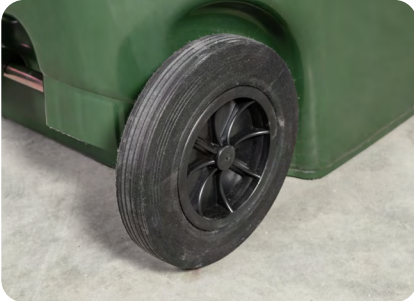
• Solid rubber tyred wheels (245mm)