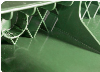
• Reinforced comb receiver