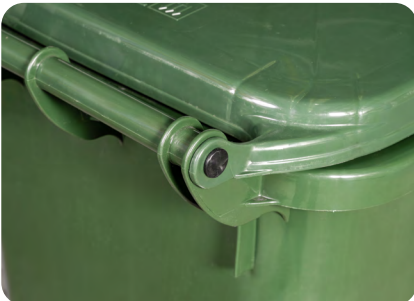
• Lid with 2 point hinges