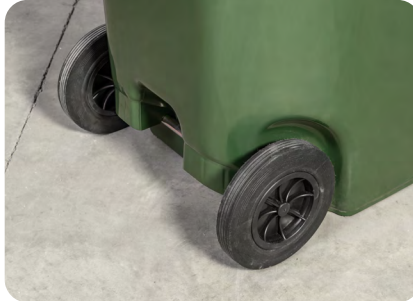
• Heavy-duty nickel-plated steel axle