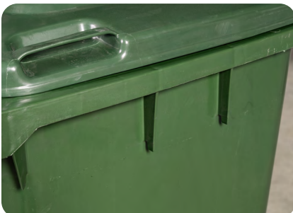
• Reinforced bin body