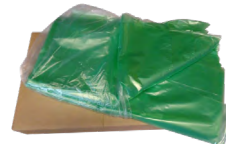
Green Liner 350pc/Carton