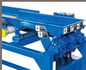
Optional Vibratory Tray with AR400 impact plates for heavy material