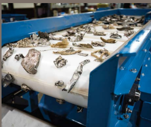
*Field test and lab results